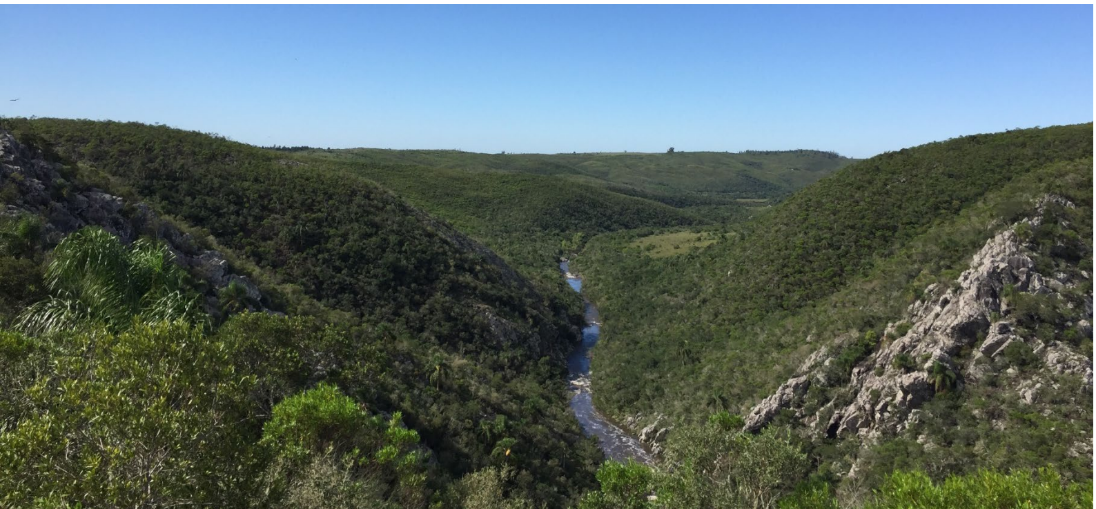
Quebrada de los Cuervos Protected Area.

The itinerary is designed to be flexible and adaptive . Depending on the starting point, the order of destinations can be adjusted to minimize travel times and maximize time in the field, ensuring the best possible birding experience throughout the tour.