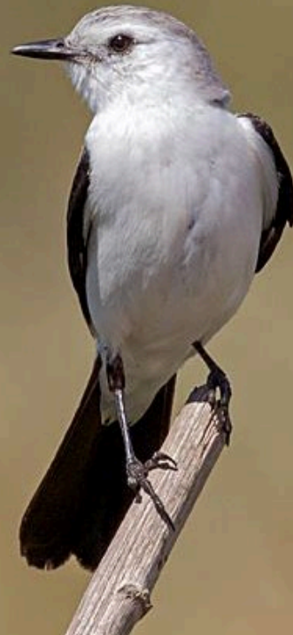
Black-and-white Monjita.