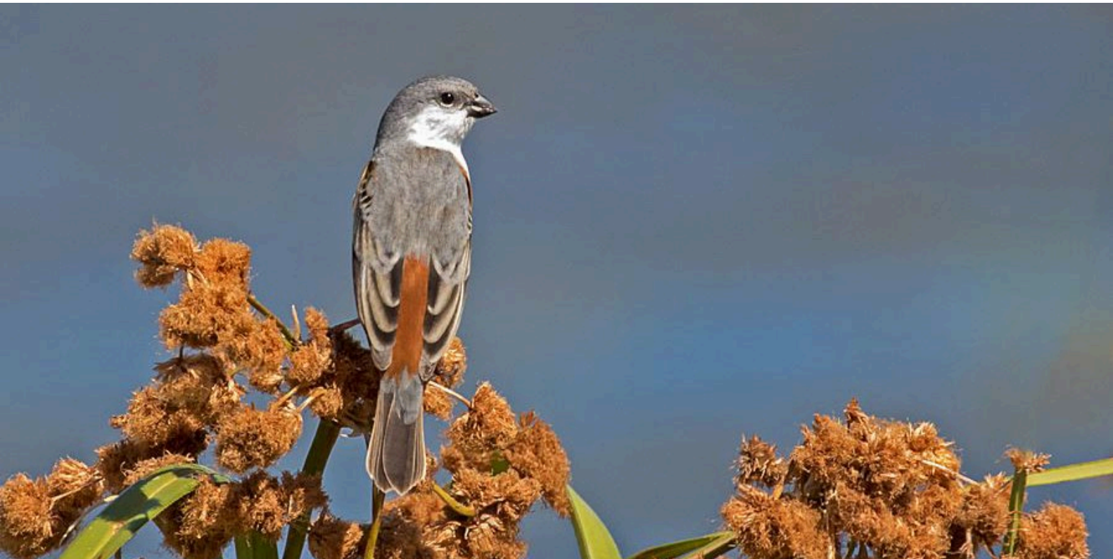
Marsh Seedeater.