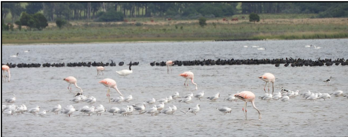
Chilean Flamingos and other birds at Laguna de Rocha Protected Area.