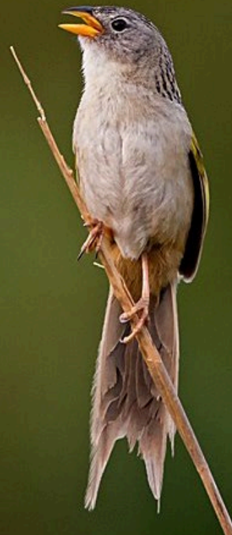
Lesser Grass-Finch.