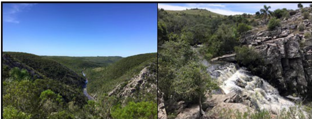
IBA – Quebrada de los Cuervos and surrounding areas.

Some target birds for days 9 and 10: Red-Winged Tinamou, Dusky-Legged Guan, Black Vulture, Turkey Vulture, Lesser Yellow-Headed Vulture, Squirrel Cuckoo, Scissor-Tailed Nightjar, Mottled Piculet, White-Eyed Parakeet, Sharp-Tailed Streamcreeper, Straight-Billed Reedhaunter, Black-