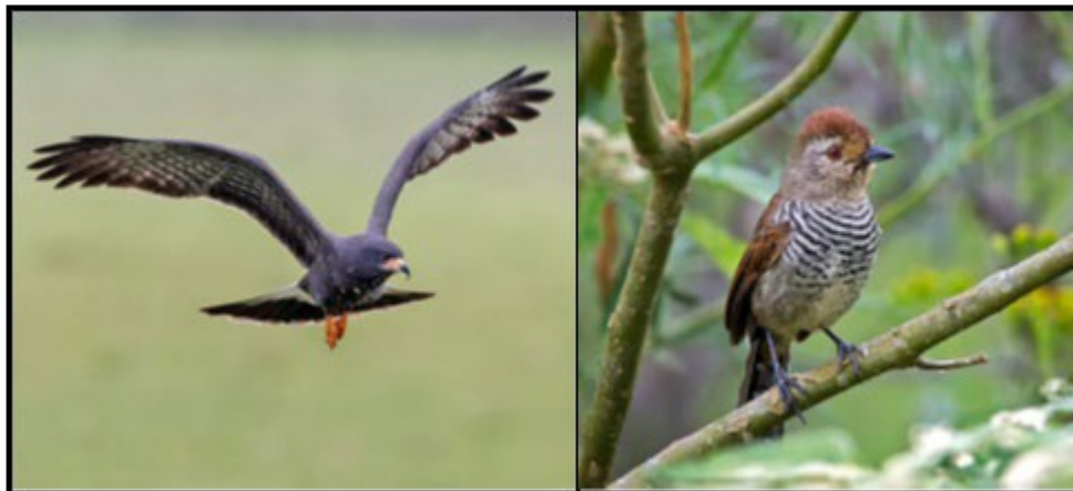
Snail Kite and Rufous-capped Antshrike.