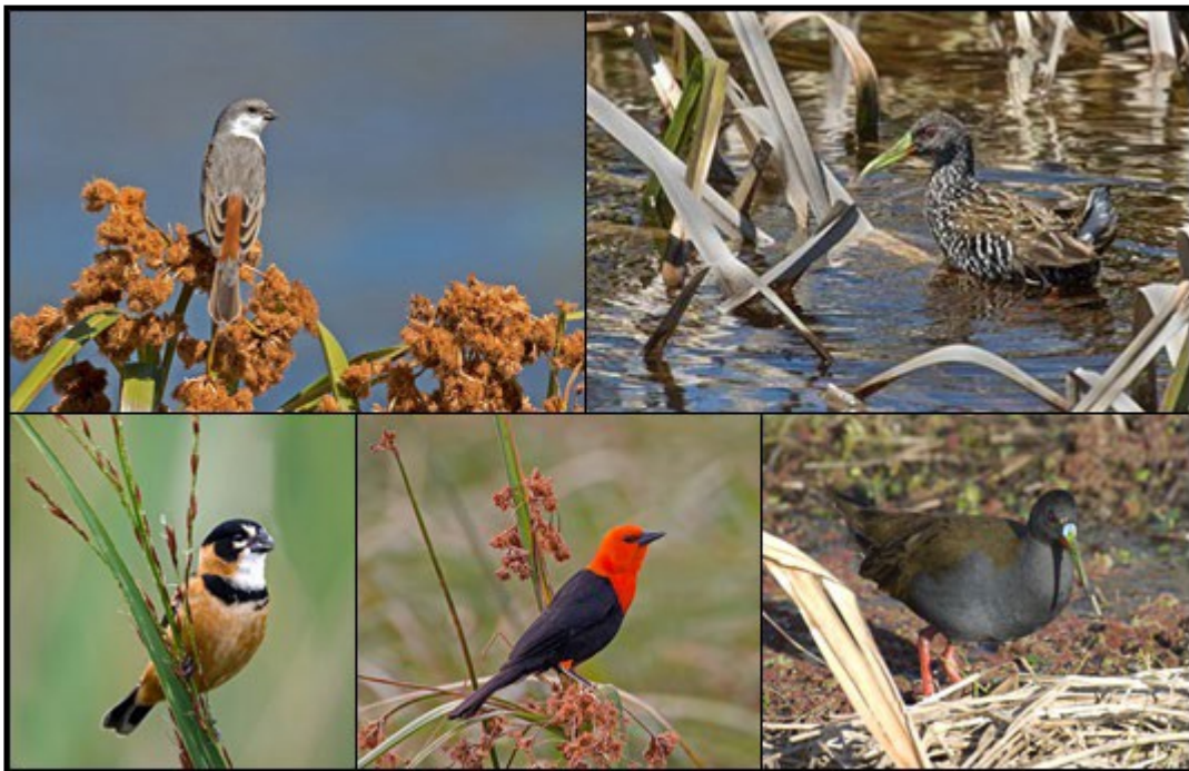
Top: Marsh Seedeater and Spotted Rail. Bottom: Rusty-collared Seedeater, Scarlet-headed Blackbird, and Plumbeous Rail.

Many-Colored Rush Tyrant, Black-And-White Monjita, Blue-And-White Swallow, Brown-Chested Martin, Gray-Breasted Martin, Curve-Billed Reedhaunter, Straight-Billed Reedhaunter, Sulphur-Bearded Reedhaunter, Yellow-Chinned Spinetail, Chestnut-Backed Tanager, Marsh Seedeater, Rusty-Collared Seedeater, Saffron-Cowled Blackbird, Scarlet-Headed Blackbird, Yellow-Winged Blackbird.