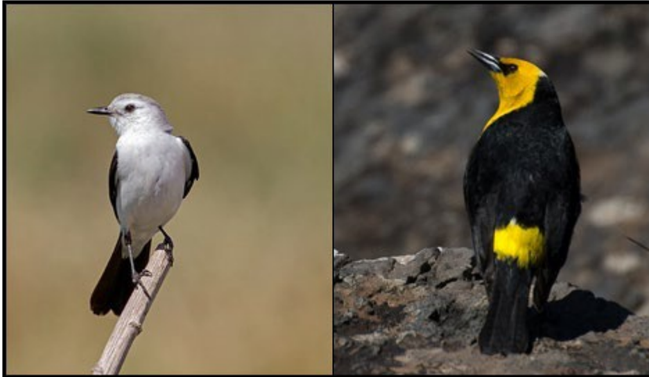
Black-and-white Monjita and Saffron-cowled Blackbird.