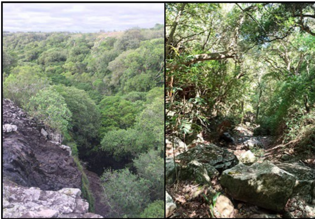
Ravine in "Bichadero" seen from above and from within.