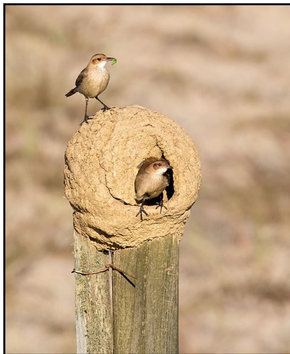
Rufous Hornero in nest.

Uruguay is a small country in Southern South America. It is approximately 600 km long both from north to south and from east to west. In spite of this tiny territory, many different environments can be found across the land: the Pampas, the Atlantic Forest, savannas, wetlands, ocean coasts, countless water courses, grasslands, ravines, several hill ranges, palm tree forests, and many others. This richness of landscapes results in a great diversity of bird species that can be seen easily, in a short time, and in short distances. The territory is also an important feeding and breeding destination for many migrant species that come in summer and winter, from the north and south of the continent. Furthermore, Uruguay is underexplored by science; biologists are still finding new species of flora and fauna and dozens of new bird species have been recorded just in the last few years.