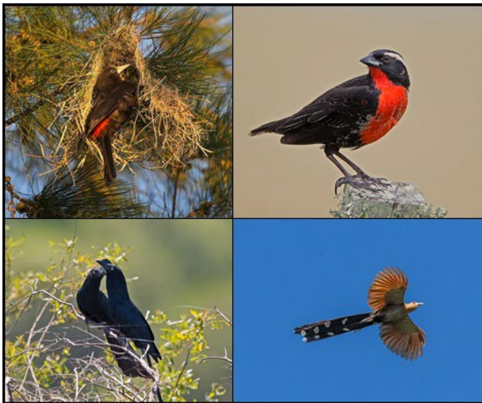
Top: Red-rumped Caique and White-browed Meadowlark. Bottom: Greater Ani and Squirrel Cuckoo.

Target birds: Cream-backed Woodpecker, Checkered Woodpecker, Large Elaenia, Pearly-vented Tody-Tyrant, Fuscous Flycatcher, Brown-crested Flycatcher, Short-crested Flycatcher, Rufous Casiornis, Grayish Saltator, Purple-throated Euphonia, Golden-rumped Euphonia, Yellow-billed Cardinal, Red-rumped Cacique, White-browed Meadowlark, Greater Ani, Smooth-billed Ani, Squirrel Cuckoo, Dark-billed Cuckoo, Greater Thornbird, Fulvous-crowned Tody-Tyrant, Little Nightjar, Black-collared Hawk, Lesser Yellow-headed Vulture, Diademed Tanager, Golden-billed Saltator.