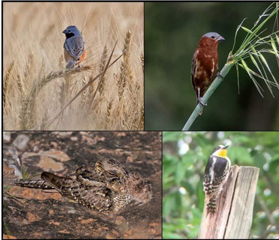
Top: Dark-throated Seedeater and Chestnut Seedeater. Bottom: Scissor-tailed Nightjar and White-fronted Woodpecker.