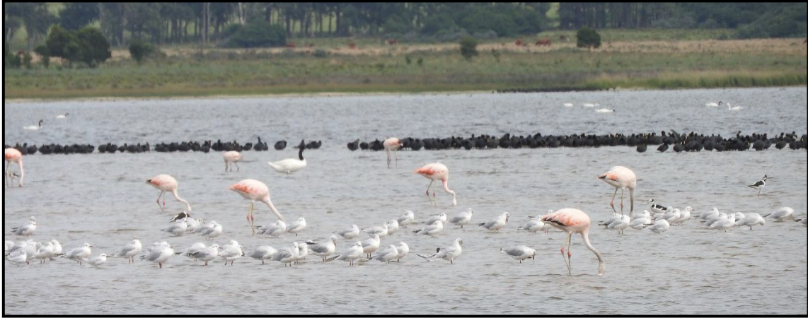
Chilean Flamingos and other birds at Laguna de Rocha Protected Area.