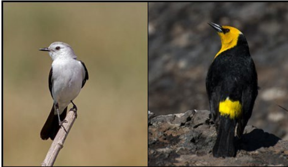
Black-and-white Monjita and Saffron-cowled Blackbird.