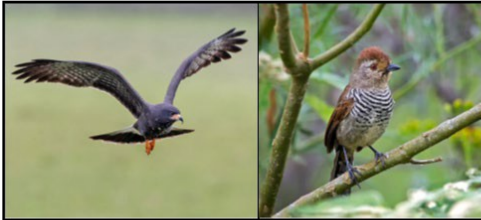
Snail Kite and Rufous-capped Antshrike.