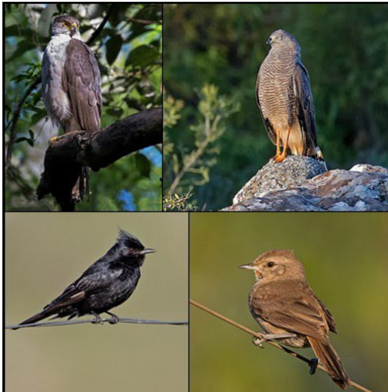
Top: Bicolor Hawk and Crane Hawk. Bottom: Crested Black-Tyrant and Short-billed Canastero.

Some special birds for days 5 to 7: Bicolored Hawk, Blue-Tufted Starthroat, Buff-Necked Ibis, Chestnut Seedeater, Chestnut-Backed Tanager, Cliff Flycatcher, Common Potoo, Crane Hawk, Crested Black-Tyrant, Fawn-Breasted Tanager, Golden-Winged Cacique, Great Pampa-Finch, Greater Rhea, Green-Backed Becard, Green-Winged Saltator, Long-Tailed Reed Finch, Long-Tufted Screech Owl., Maguari Stork, Olivaceous Elaenia, Olivaceous Elaenia, Orange-Breasted Thornbird, Plumbeous Ibis, Red-Crested Finch, Red-Legged Seriema, Scissor-Tailed Nightjar, Short-Billed Canastero, Ultramarine Grosbeak, Wedge-Tailed Grass Finch, White-Eyed Parakeet, Yellow-Rumped Marshbird.