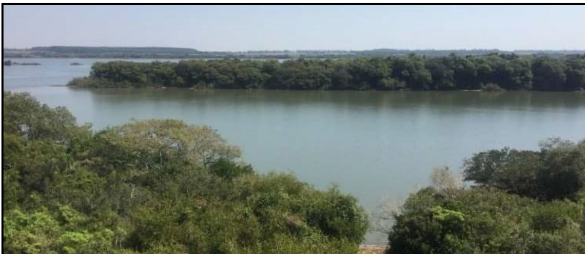
Riparian forest on the shores of the Uruguay river.