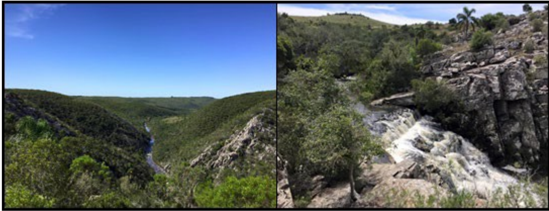
IBA – Quebrada de los Cuervos and surroundings.

Some special birds for days 8 and 9: American Kestrel, Black Vulture, Black-And-White Monjita, Chestnut Seed eater, Diademed Tanager, Dusky-Legged Guan, Green-Winged Saltator, Lesser Grass-Finch, Lesser Yellow-Headed Vulture, Mottled Piculet, Red-Winged Tinamou, Saffron-Cowled Blackbird, Scissor-Tailed Nightjar, Sharp-Tailed Streamcreeper, Squirrel Cuckoo, Straight-Billed Reedhaunter, Tropical Parula, Turkey Vulture, White-Eyed Parakeet, White-Necked Thrush.