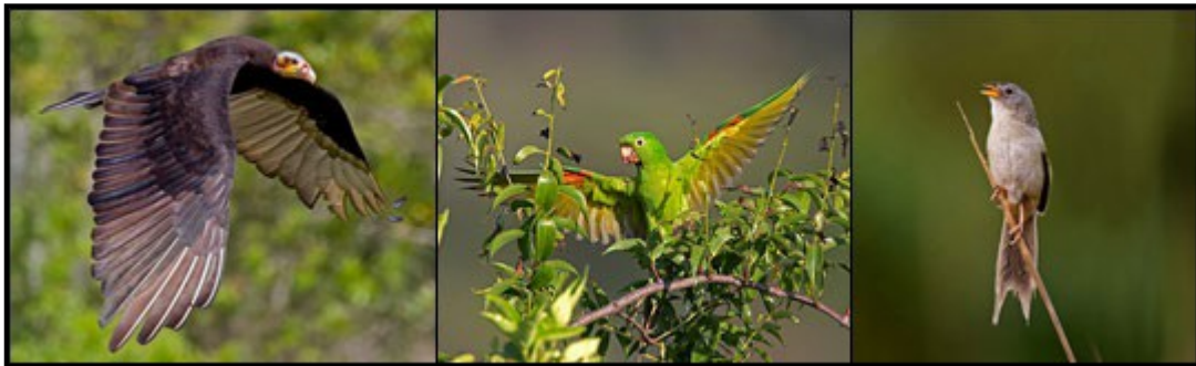
Lesser Yellow-headed Vulture, White-eyed Parakeet, and Lesser Grass-Finch.

Some special birds for days 8 and 9: American Kestrel, Black Vulture, Black-And-White Monjita, Chestnut Seed eater, Diademed Tanager, Dusky-Legged Guan, Green-Winged Saltator, Lesser Grass-Finch, Lesser Yellow-Headed Vulture, Mottled Piculet, Red-Winged Tinamou, Saffron-Cowled Blackbird, Scissor-Tailed Nightjar, Sharp-Tailed Streamcreeper, Squirrel Cuckoo, Straight-Billed Reedhaunter, Tropical Parula, Turkey Vulture, White-Eyed Parakeet, White-Necked Thrush.