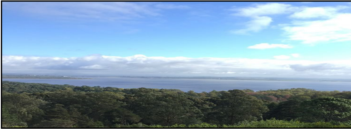
Panoramic view of Laguna del Sauce.

Some special birds for days 13 to 15: American golden-plover, american oystercatcher, baird's sandpiper, bay-capped wren-spinetail, black skimmer, black-necked stilt, black-necked swan, blackish oystercatcher, brown-hooded gull, buff-breasted sandpiper, buff-winged cinclodes, chilean flamingo, chiloe wigeon, common tern, coscoroba swan, gray-cowled wood-rail, great grebe, greater yellowlegs, hudsonian godwit, kelp gull, lesser yellowlegs, many-colored rush tyrant, neotropic cormorant, olrog's gull, paraguay snipe, red knot, red-fronted coot, red-gartered coot, ringed kingfisher, royal tern, ruddy turnstone, rufous-chested dotterel, rufous-sided crane, sandwich tern, scarlet-headed blackbird., semipalmated plover, snowy-crowned tern, south american tern, two-banded plover, white-rumped sandpiper, white-throated hummingbird, white-winged coot, wren-like rushbird, yellow-billed tern.